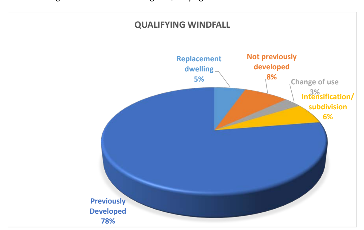
Chart 2. Categories of Sites contributing to Qualifying Windfall

4.1 There is strong evidence that windfall sites have consistently come forward in Basildon. This is demonstrated by the evidence of past trends and the justification below which has taken into account local circumstances and policy to determine the likely hood of these offering a reliable future supply.