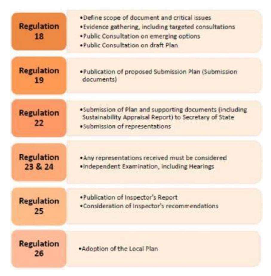
Figure 4-1: Local Plan flow chart