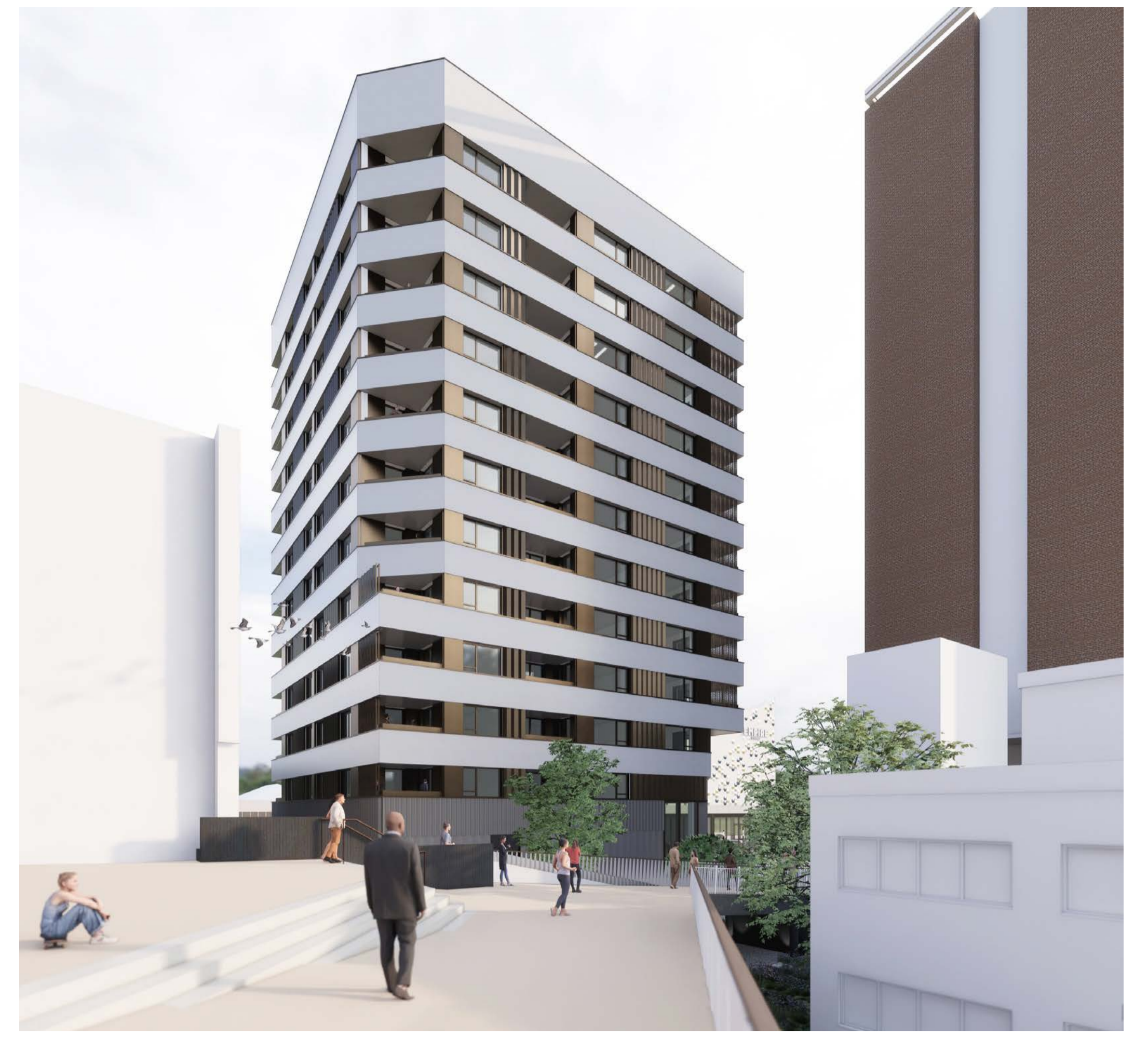
View from lower pavement towards East Square