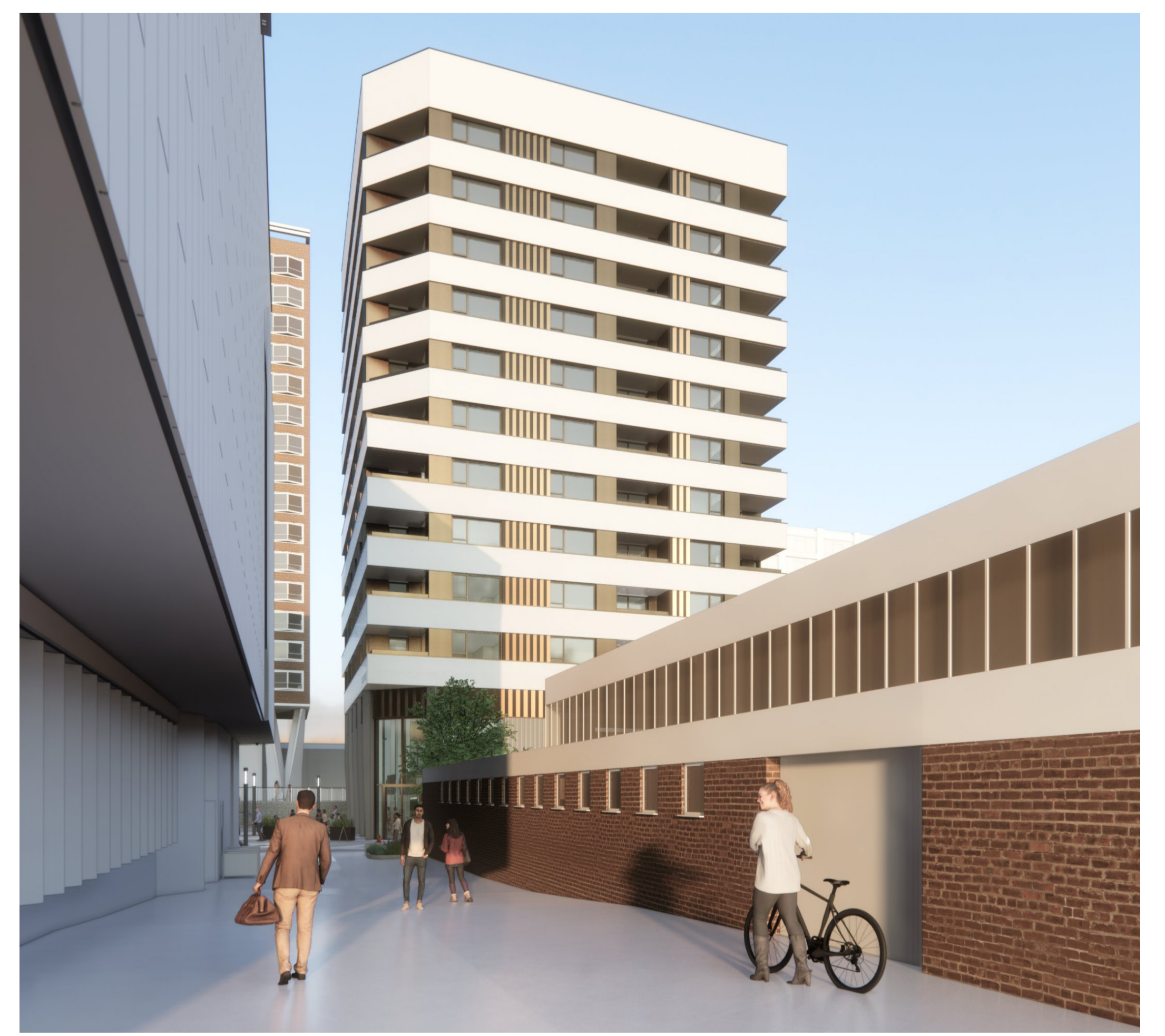
View of new route from Car Park 2 to East Square

Thank you. Please provide your feedback on the forms provided.