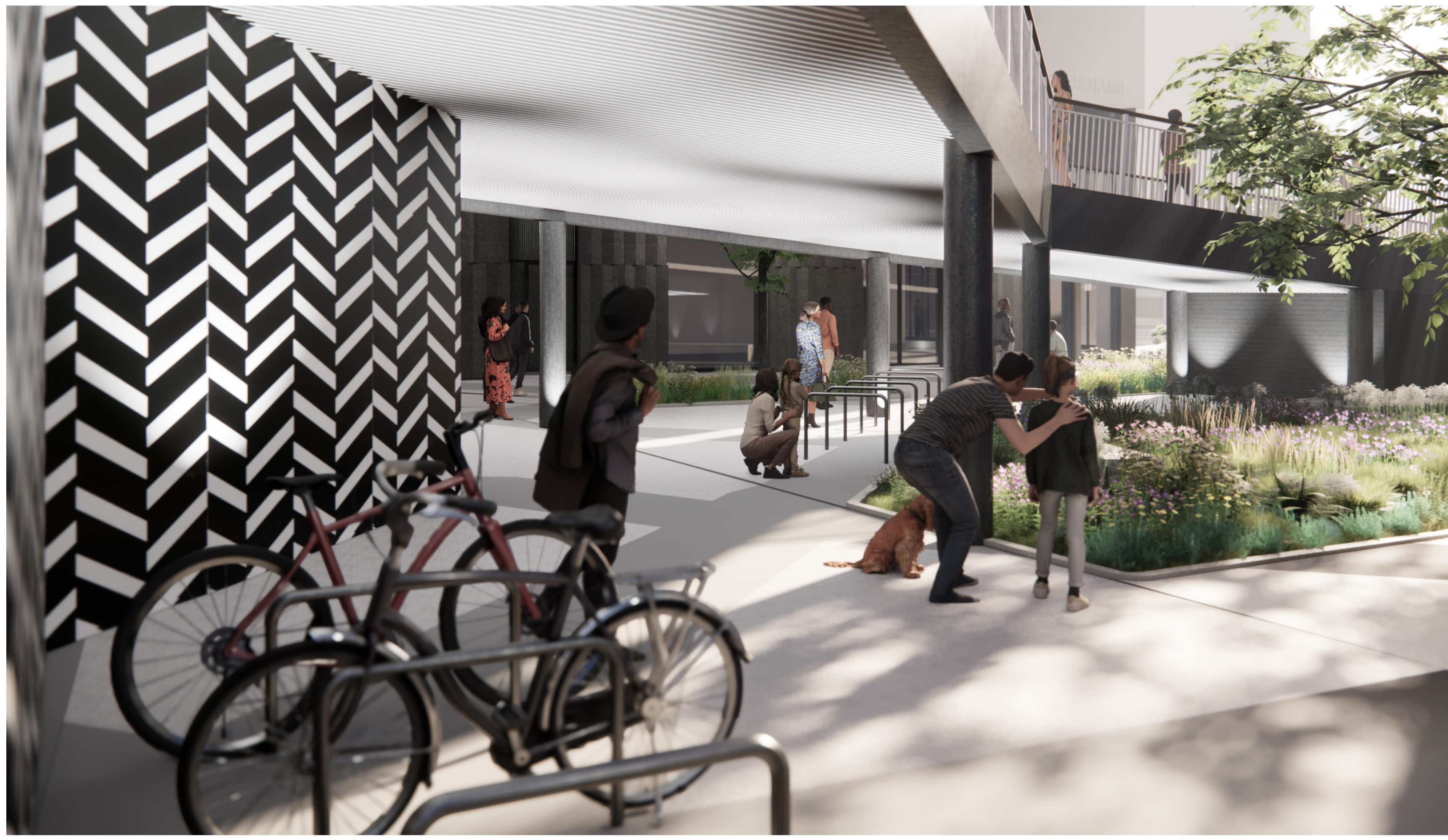
Open, safer route between East Square and Car Park 1