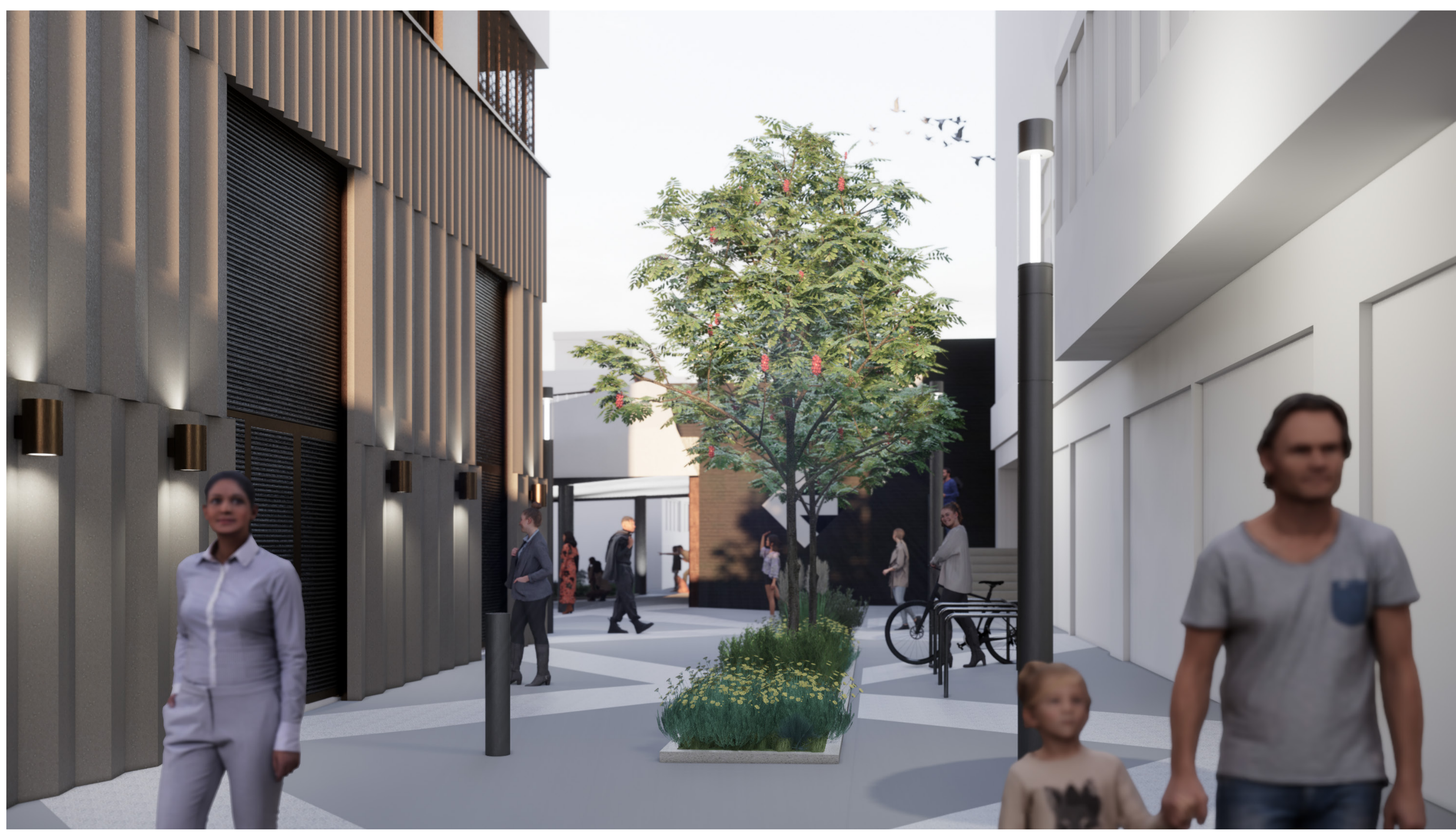
View of new landscaping connecting North Gunnels to Car Park 1