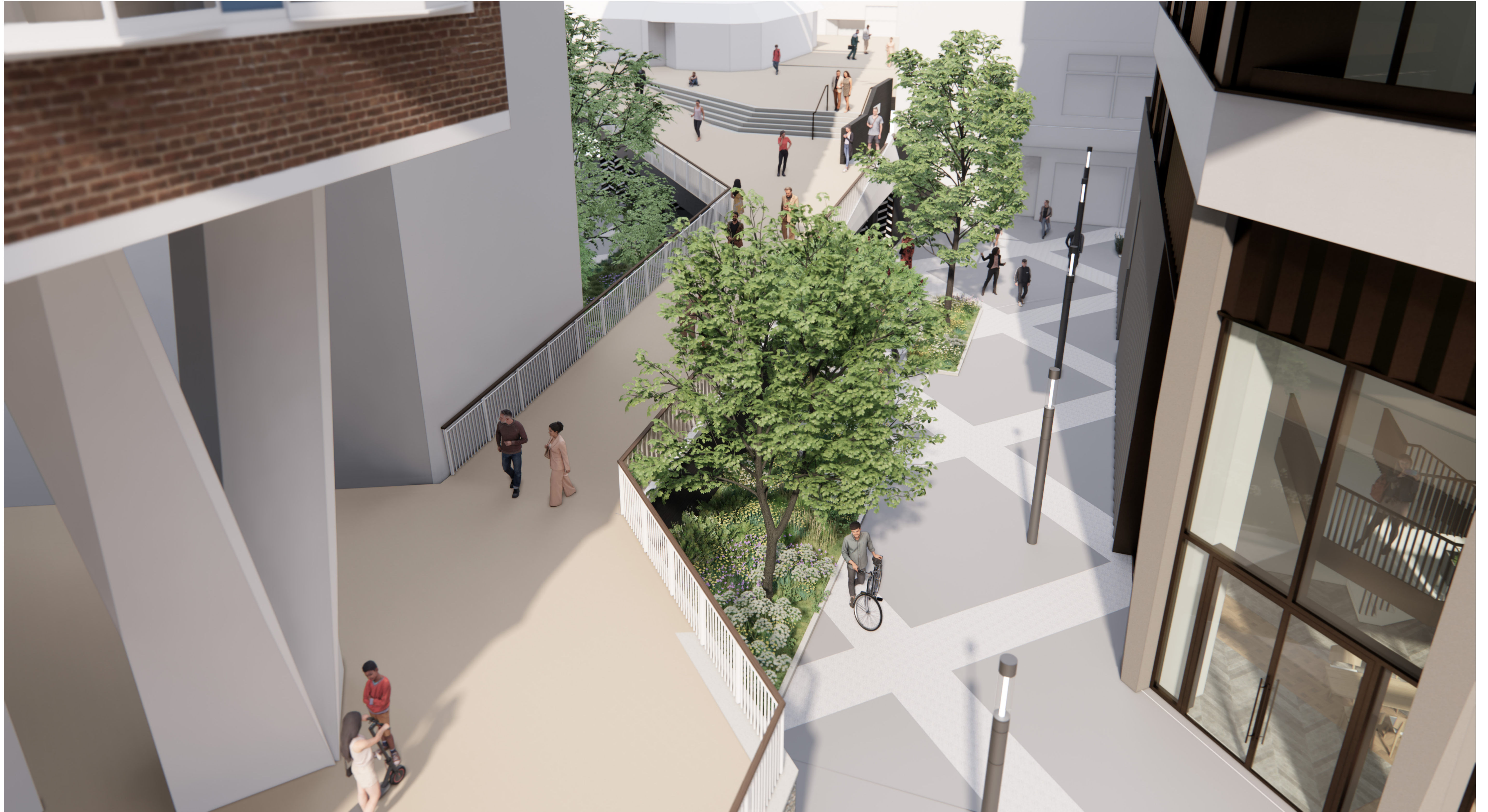
Aerial view of new landscaping and connection to lower pavement