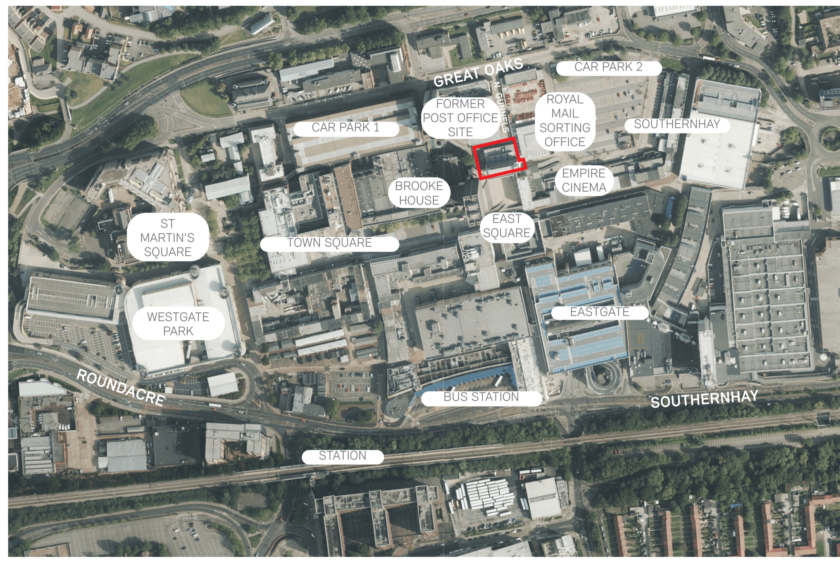
Aerial view of Basildon Town Centre

We are delighted to share with you today the proposals for the former post office site in Basildon town centre. This project builds on the Council's broader regeneration objectives, delivering new homes and improvements to the town centre to make Basildon a destination of choice. Our first public event showed early proposals in August 2021. Today we share updated designs to be submitted for planning permission in Spring 2023.