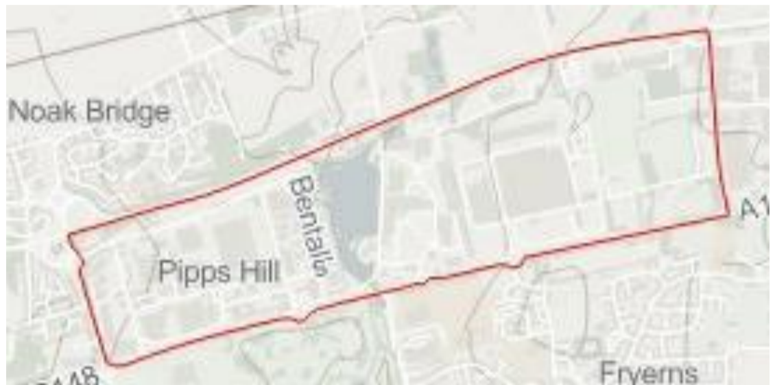
Festival Leisure Park/Mayflower Retail Park