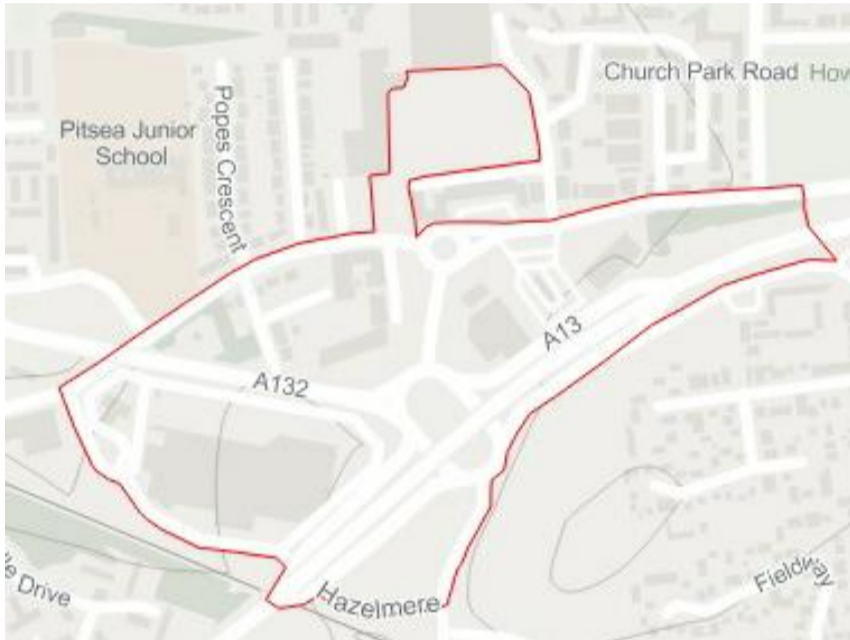
Pitsea Town Centre