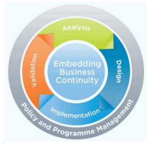
Business Continuity Management Lifecycle (BCI 2015)

<u>Local</u> – The business continuity management lifecycle (shown below) shows the stages of activity that an organisation moves through and continuously repeats to improve their resilience to disruptions. The business continuity policy acts as the cornerstone for the successful delivery of a business continuity management system and forms the outer ring of the lifecycle.