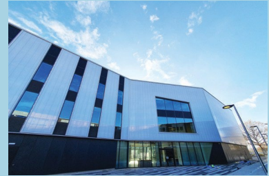
Educational attainment and aspiration