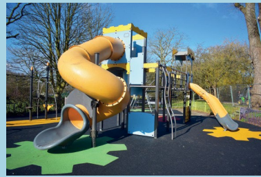
Social inclusion and community cohesion