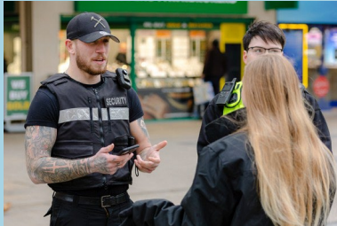
Reduction in crime and anti-social behaviour

There is much research to evidence the benefits that engagement with leisure and cultural activities can have on contributing to improving people’s lives. Leisure and culture can have a positive effect on: