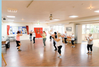
Mental and physical health and wellbeing