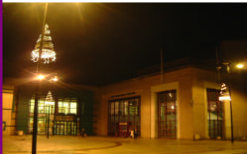
The Basildon Centre and the Towngate Theatre, St. Martin's Square, Basildon

This leaflet is one of a series designed to assist in providing an understanding of the role that the Planning Service plays in helping to shape the environment in which we live.